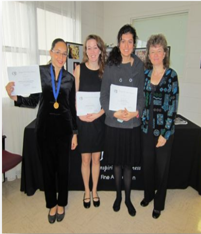
Junior/Senior Strings with Judge