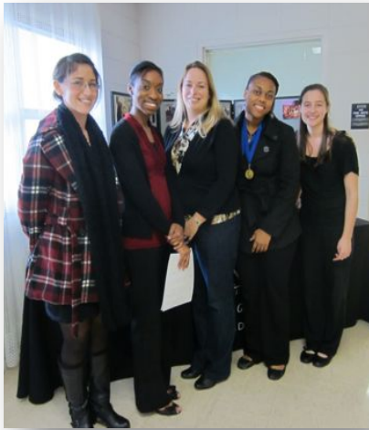
Woodwind Concerto with Judge