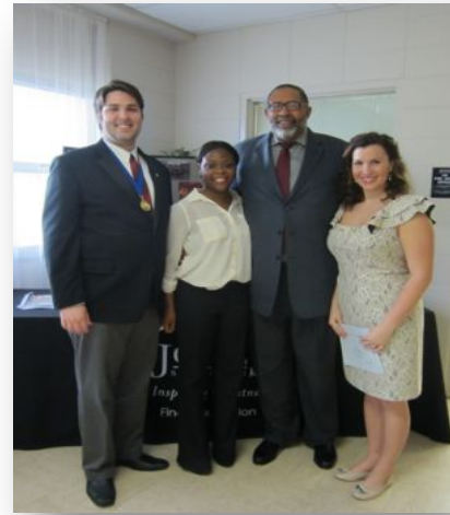
Junior/Senior Voice with Judge