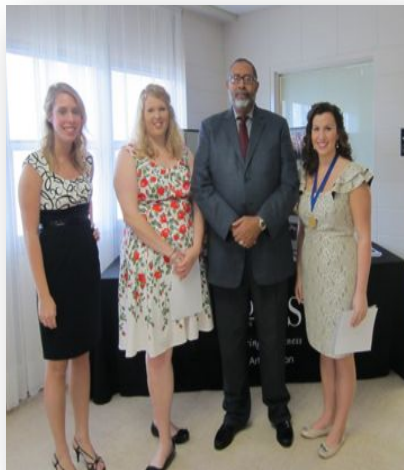
Vocal Aria with Judge