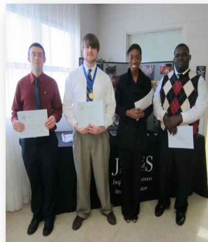
Junior/Senior Woodwind Solo