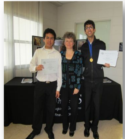
Freshman/Sophomore Strings with Judge