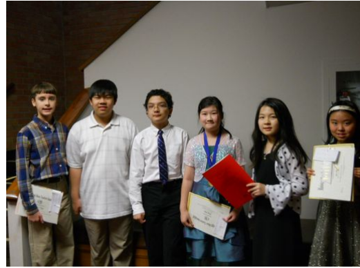
Junior Piano Concerto Participants