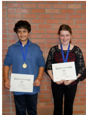
Junior and Senior Strings Concerto