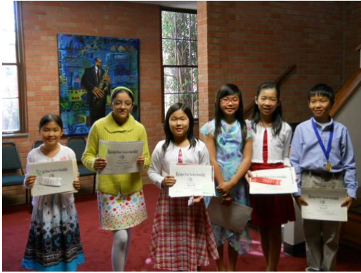
Elementary Piano Concerto Participants