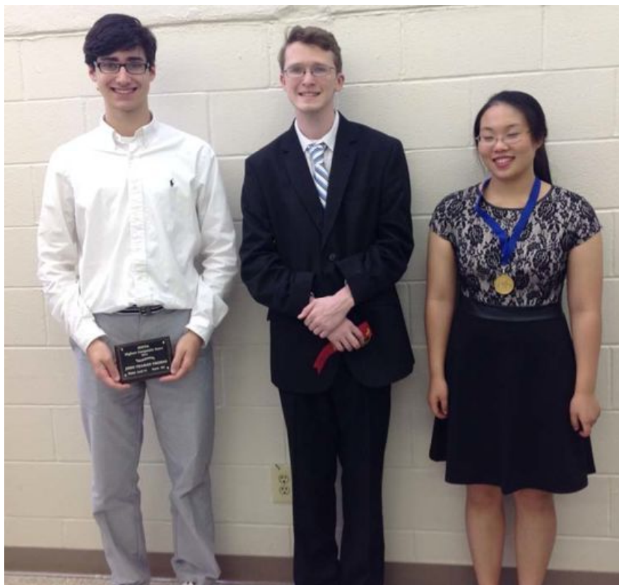
Level 11 Performance