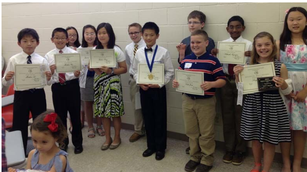
Level 5 Performance