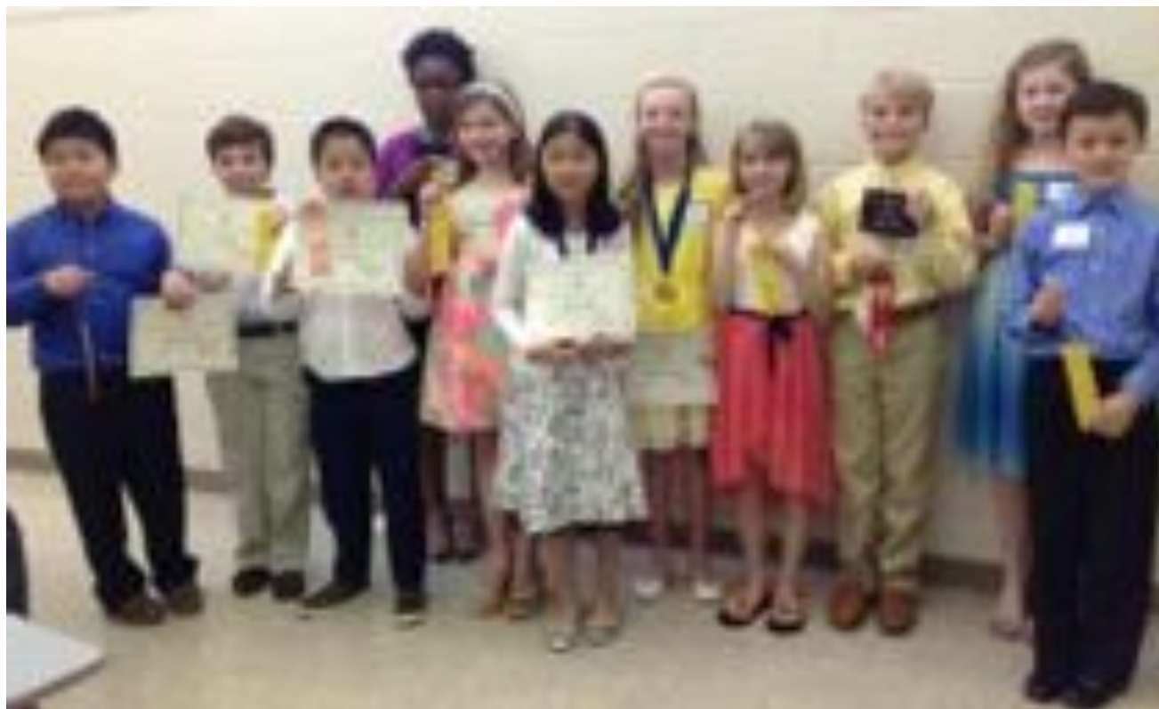
Level 4 Performance