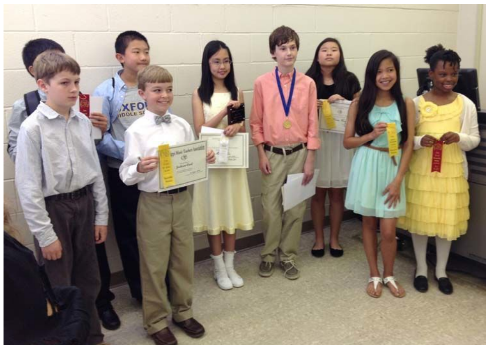
Level 6 Performance