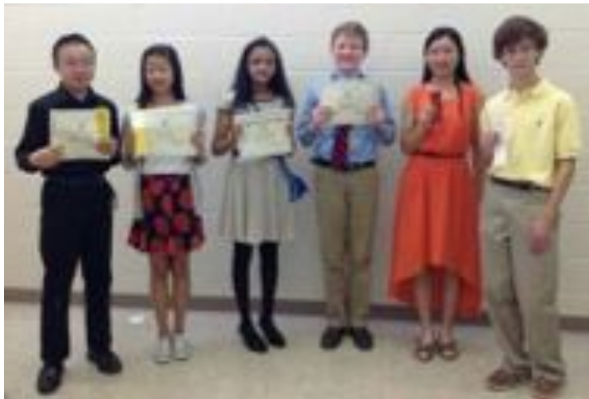
Level 7 Performance