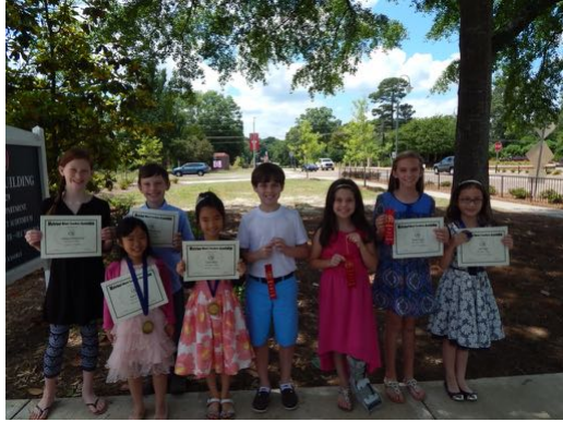
Piano Ensemble A & B