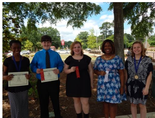
Vocal 9, 10, 11, & 12