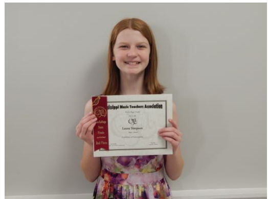
Piano Level 6