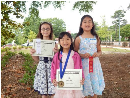
Piano Sonata/Sonatina A