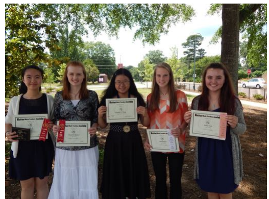
Piano Level 10