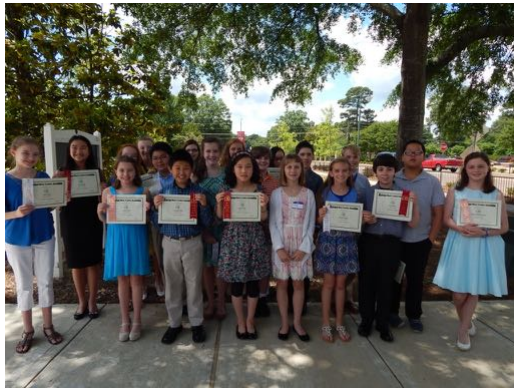
Piano Level 6