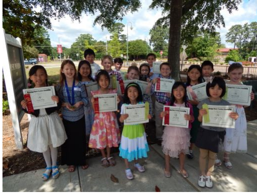
Piano Level 3 & Below