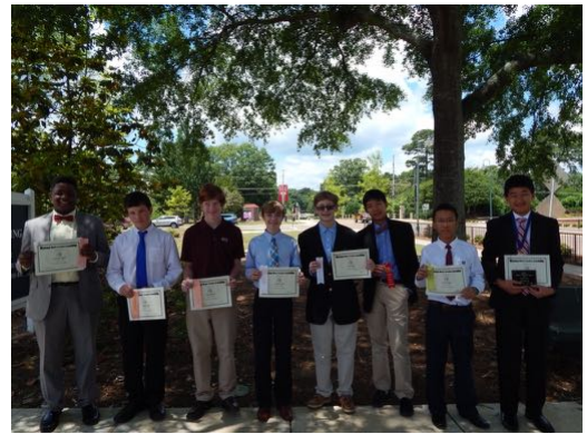
Piano Level 8