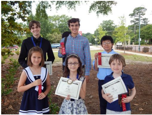
Strings Levels A, B, C, D, & F