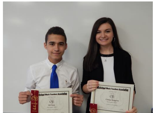
Piano Ensemble E