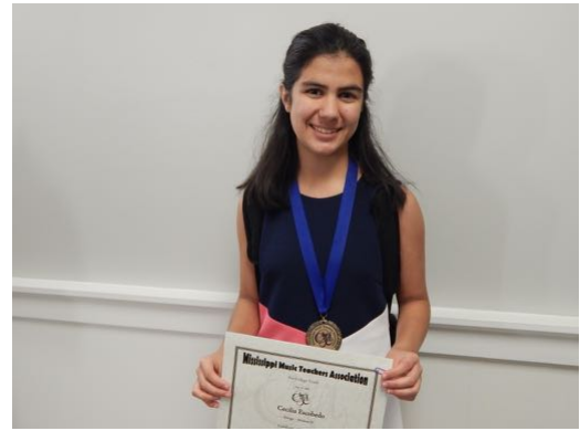
Strings A, B, C, D, & F