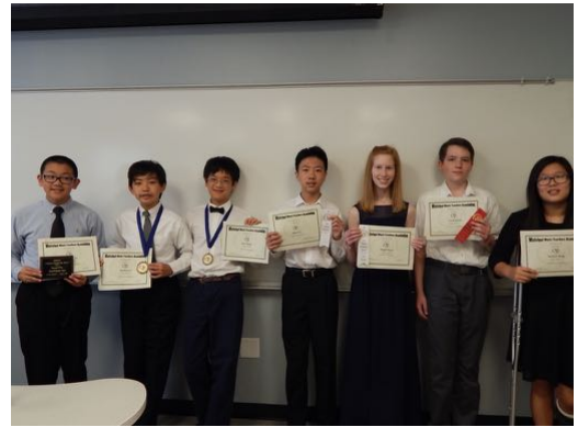
Piano Level 7