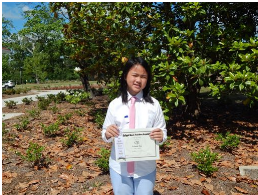
Piano Level 5