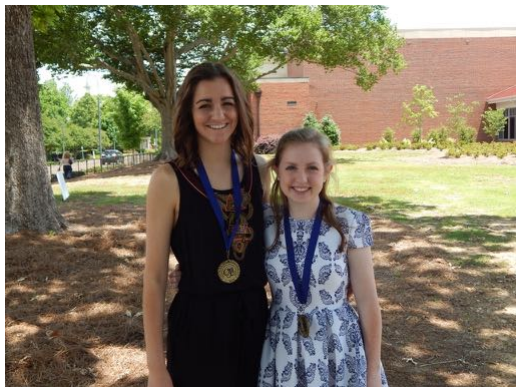
Piano Ensemble E