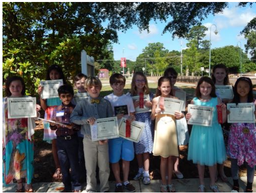
Piano Level 4