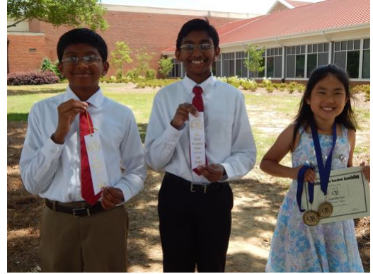
Piano Ensemble C