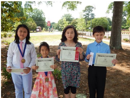
Theme & Variations A & B