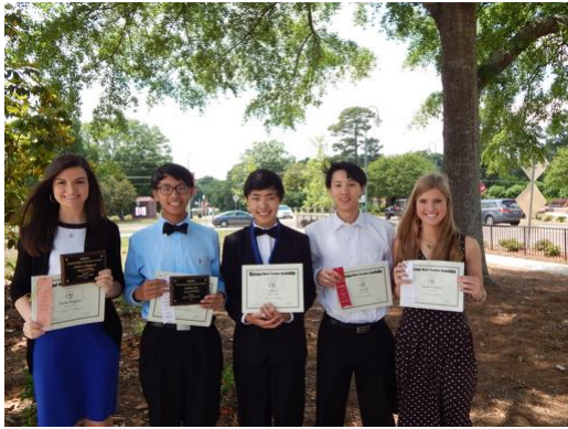
Piano Level 11