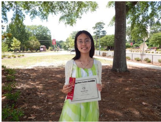
Piano Level 8