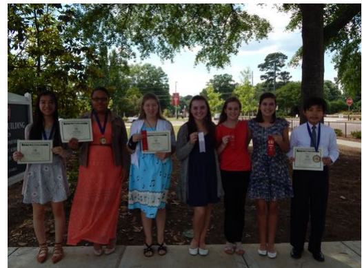
Theme & Variations C, D, & E