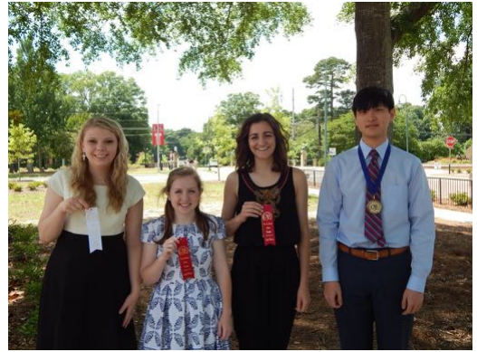
Piano Level 12