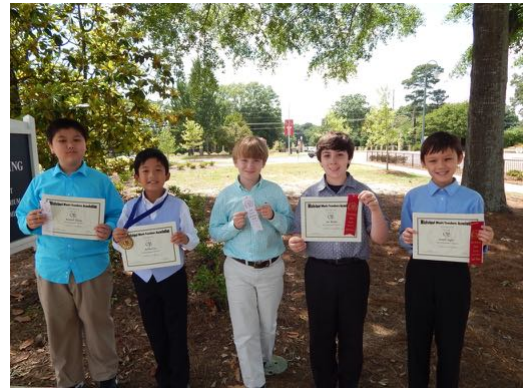
Piano Sonata/Sonatina B