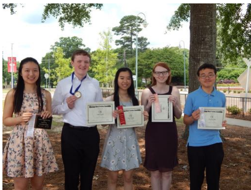
Piano Level 9