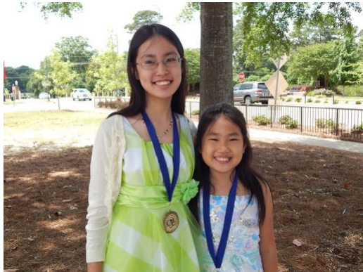
Piano Ensemble C