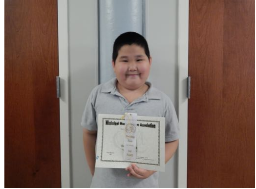
Piano Level 3 & Below