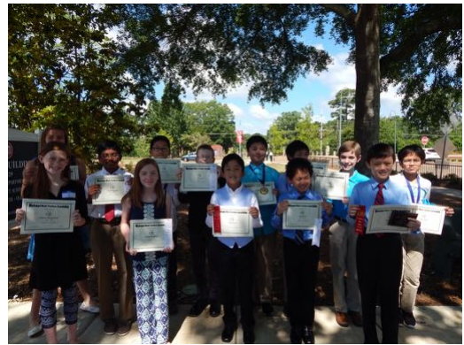
Piano Level 5