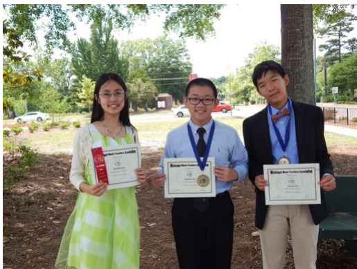
Piano Sonata/Sonatina C