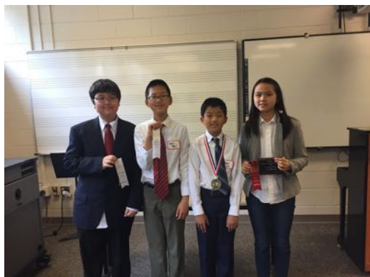
Piano Level 6