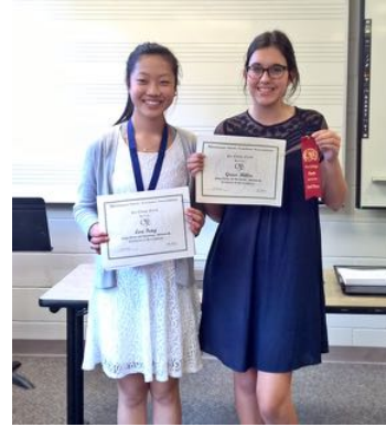
Theme and Variations D