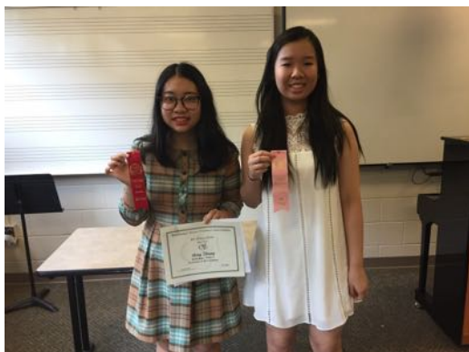
Piano Level 10