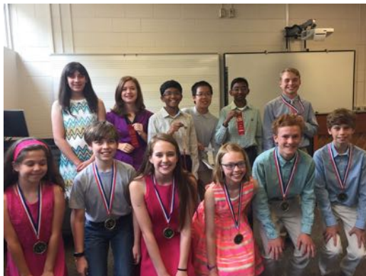
Piano Ensemble C