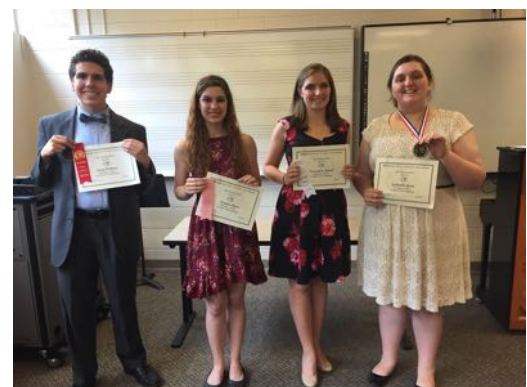
Vocal Level 12