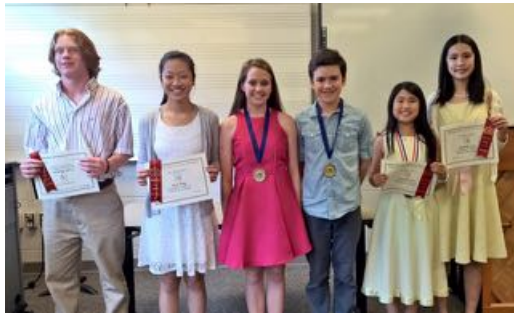
Piano Ensemble D