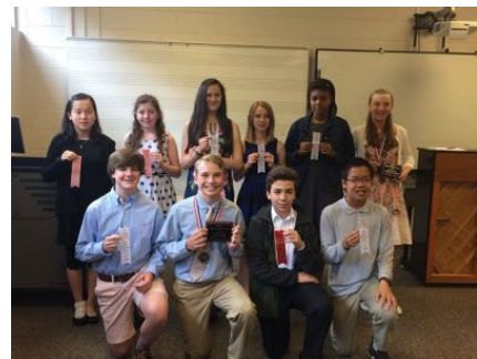
Piano Level 7