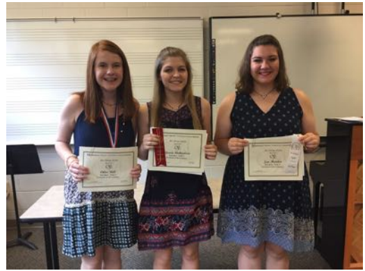
Vocal Level 10