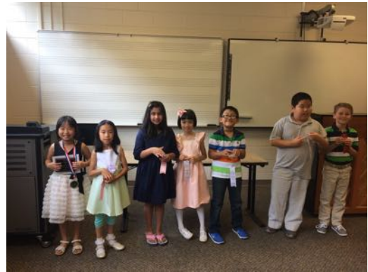
Piano Level 3 and Below