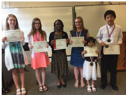
Theme and Variations A, B, C, E