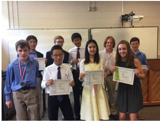
Piano Level 9