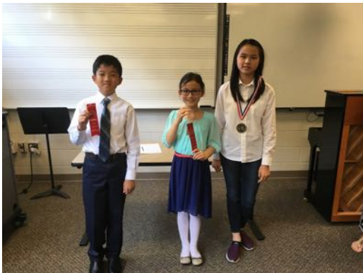
Piano Sonata/Sonatina B