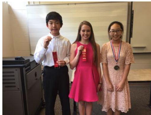
Piano Level 8