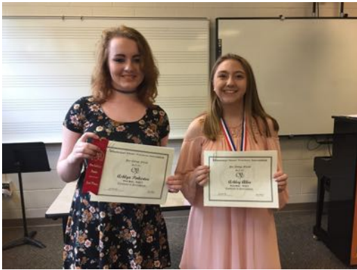
Vocal Level 9