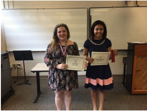
Vocal Level 11