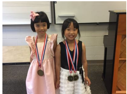
Piano Ensemble A