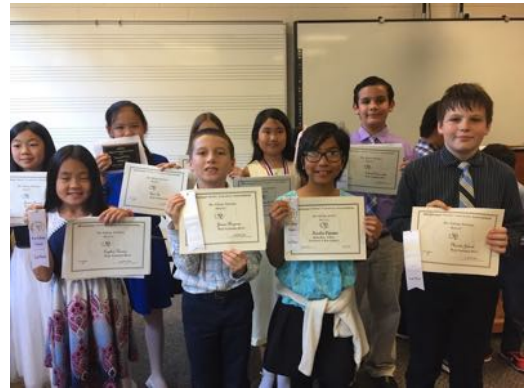
Piano Level 4