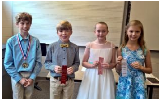
Piano Level 5