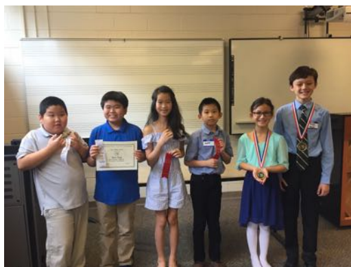
Piano Ensemble B