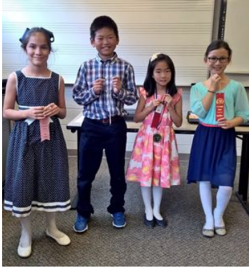
Strings B (Kate Lansford not pictured)