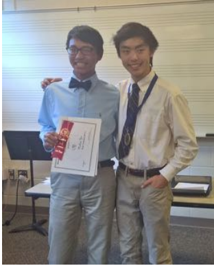
Piano Level 12